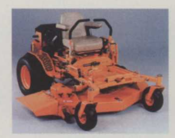
The wide track Scag Turf Tiger

Work long and fast with the Turf Tiger from Scag. Its 10-gallon fuel tank and 10-mph ground speed, combined with wide-track stance and 23-in. high traction tires makes work easy. Innovative shaft-drive cutter deck features 90-degree gear box system. Either 52- or 61-in.