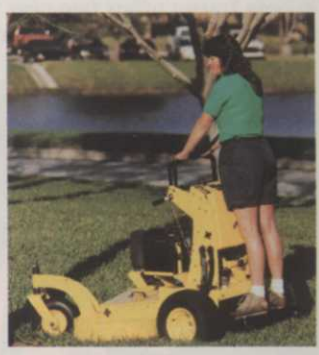
Great Dane Surfer easy to ride

powered by a 16-hp Vanguard, a 18-hp Kohler and Vanguard-B&S with electric start or a 22-hp Kohler electric start. Dual hydro-gear BDP-