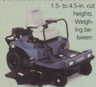
Dixon 5022 is easy on the turf.

The Dixon 5022 zero-radius turn commercial mid-mount mower is powered by a 22-hp Kohler Command engine. It is available with 42-, 50- and 60-in. deck options with