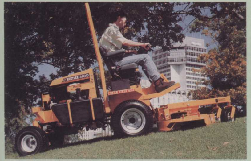
Excel Industries continues to offer unmatched traction and stability with its new all-wheel-drive 3400. Hustler uses the easy-to-use H-bar steering system.