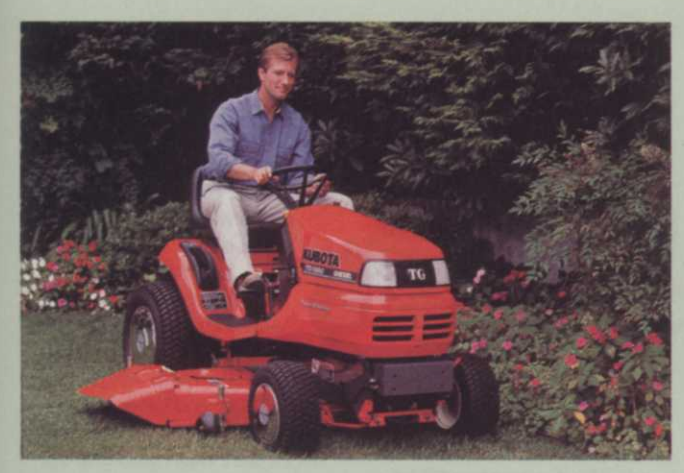
Kubota Tractor offers two new 18-hp riders, one gas-powered, the other diesel. Mid-mount mower available in 48 or 54 inches.