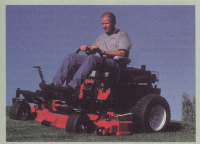
Encore's new 61-in. Powler Mid Cut is powered by a 22-hp, liquid-cooled Kawasaki. The unit rides on 24-in. Super Turf tires.