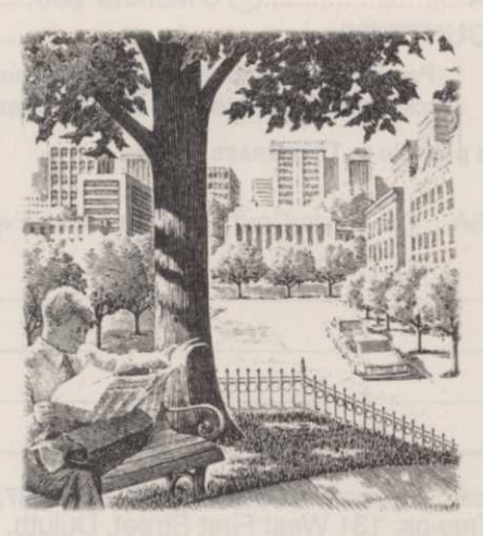
A World With Trees...where it's a pleasure to live, every day