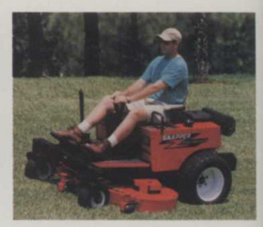
Snapper's twin-stick steering

New this spring is the 24.5-hp, diesel model, Legacy garden tractor. The Briggs & Stratton DM950D, with fuel injection and 3-cylinder liquid cooled design, sits on a C-channel frame and rides above a heavy-duty cast-iron front axle. Free-floating shaft driven mower decks are available in 48- or 60-in. widths. Cut