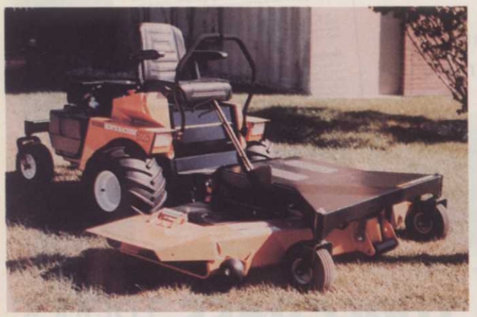
Woods Equipment Mow'n Machine cuts without scalping.