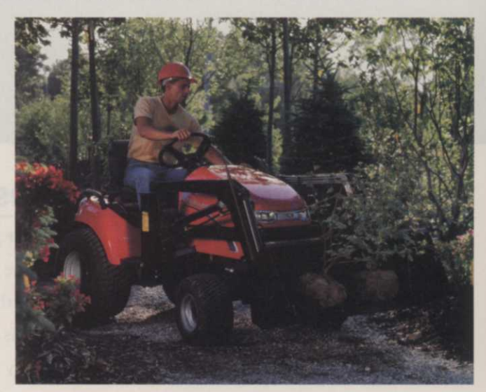
Free-floating mower decks offered for Simplicity Legacy tractor

height is electrically adjustable from 1 to 5 in. Unit can be fitted with any of 26 optional attachments, including rear PTO, plows and more.