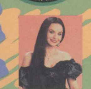
Crystal Gayle in Concert Saturday Night