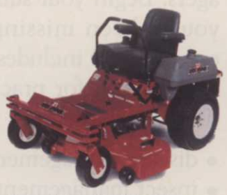
Yazoo/Kees Mini-Max is new.

New for 1999, the Mini-Max from Yazoo/Kees, is a smaller version of the standard ZT Max. It has the same zero-radius turn, 10-gallon