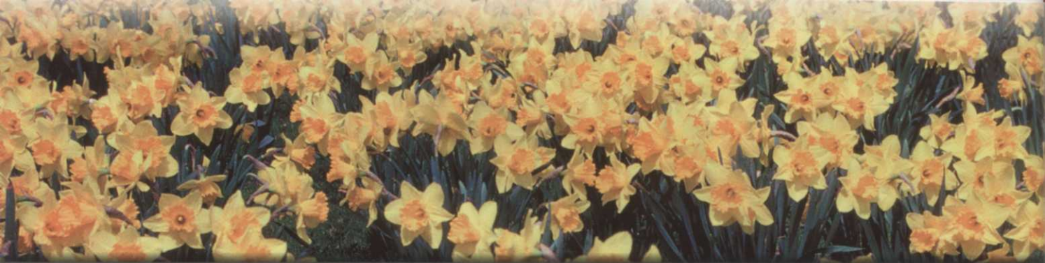
Yellow Sun, aka King Alfred (Early) 14"