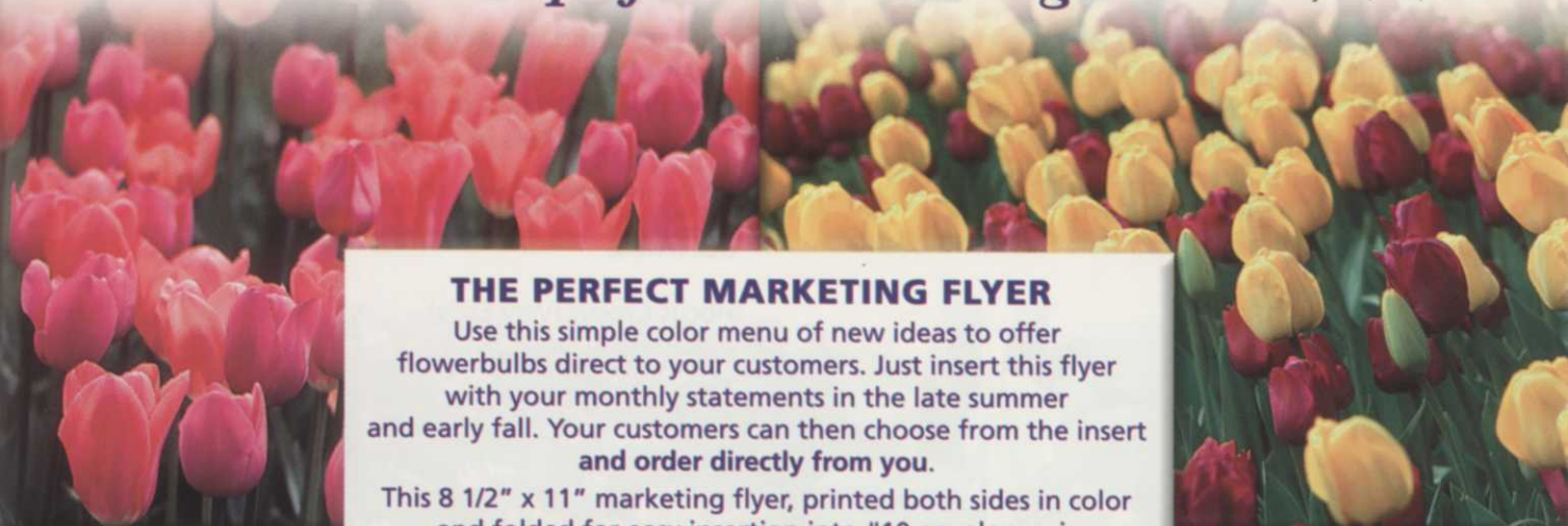
Pink Margarita (Mid) 26"