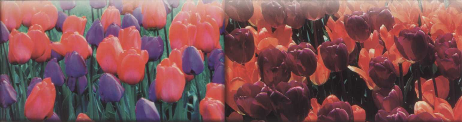
The Crusaders (Mid) 24"