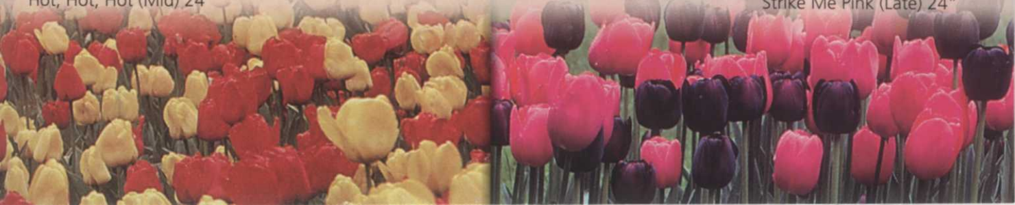
Strike Me Pink (Late) 24"