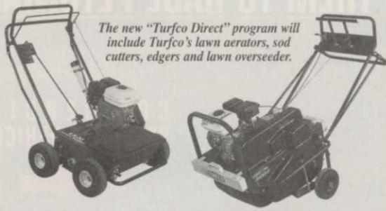
The new "Turfco Direct" program will include Turfco's lawn aerators, sod cutters, edgers and lawn overseeder.

The new "Turfco Direct" phone number is (800) 679-8201. Fax requests and orders can be sent to (612) 785-0556, mailed to Turfco Manufacturing, Inc., 1655 101st Ave. N.E., Minneapolis, MN 55449-4420 or e-mailed to sales@turfco.com . For fast, immediate savings, visit the company's website at www.turfco.com .