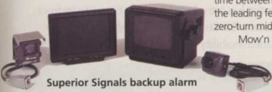
Superior Signals backup alarm

Warn 'em or see 'em. Install a back-up alarm on any unit. The Safe-T-Alert 3000 series from Superior Signals comes in decibel ranges from 82 to 107. The STA-30572 can be manually adjusted. The Super-Sight collision avoidance system allows the driver of a vehicle to see objects out of sight of the rear-view