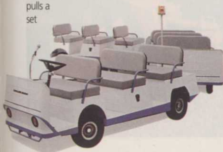
Taylor Dunn Corp.

Move up to 30 people with the E-Tram unit from Taylor-Dunn. Towing unit carries 8 people and pulls a set