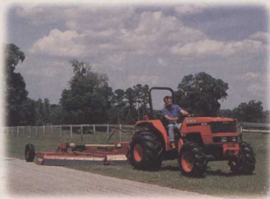
Kubota also offers an M4700 model with 4-wheel drive.

Creep speed transmission has 12 forward speeds (0.17-13.76 mph) with turf tires.