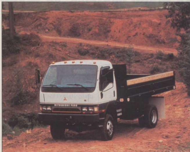
Isuzu medium-duty, cab-over trucks got a high rating.

► The panoramic windshield gives good visibility, with drop-design side windows to help eliminate blind spots. Middle passenger seat folds down as a workstation and N-