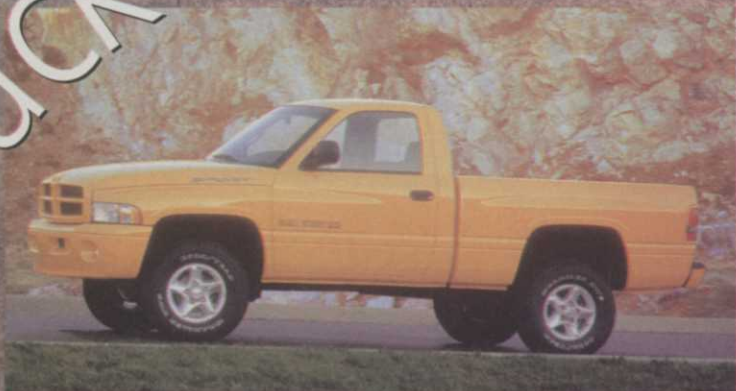
Ram Sport 1500