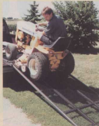
Innovative Industries' new ramp

Innovative Industries' new Stowramp is a 100% self-contained, heavy duty ramp with a 1,000 lb. capacity. There is no need to remove a truck's tailgate unit — it bridges the tailgate so there is no