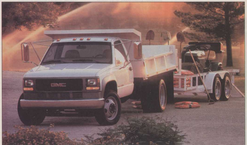
Sierra 3500 HD, with both carrying and pulling capacity, is the workhorse of many landscape firms.