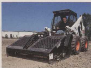
Landscape Rake grades, levels and picks up debris.