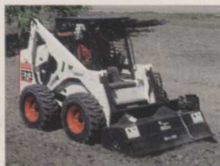
Tiller breaks up clumps, mixes material into soil.