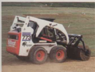
Sod Layer does the job quickly, effortlessly.