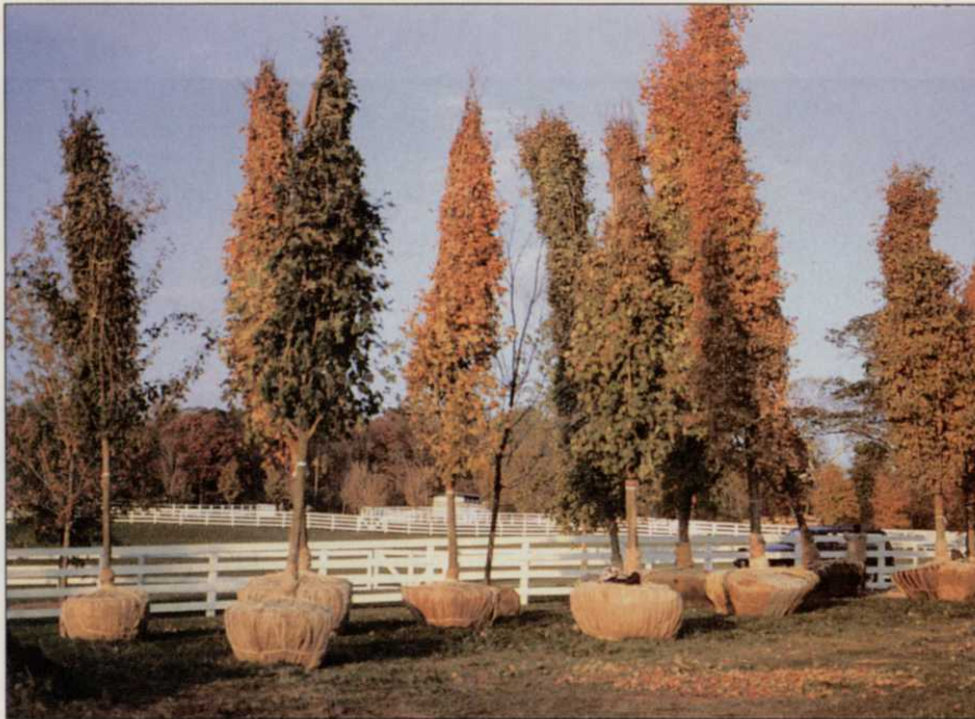
Sugar maple trees, unloaded and ready for fall planting in Sharon, Connecticut

transplanting, as they appeared in the nursery. In my experience most trees appear reasonably healthy during the first growing season as a transplant, but often appear less vigorous the second growing season. One reason for this is that energy reserves present within the tree prior to transplanting allow it to produce a crop of normal foliage the first growing season, but subsequent root loss prevents the transplanted tree from storing sufficient energy reserves for the second growing season. Survival, of course, depends on the generation of new roots, the faster the better.