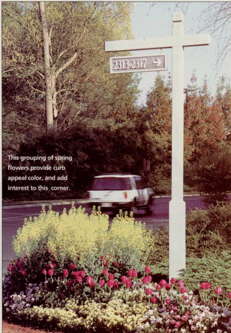
This grouping of spring flowers provide curb appeal color, and add interest to this corner.

Copies of the video are available from US or Canadian bulb suppliers or from the International Flower Bulb Center in Holland (fax: 011-31-2525-226-92). For North American viewing, request tapes in NTSC American format. Cost is $13 per tape, plus shipping/handling.