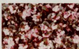
Treated with Flower Saver™, Healthy Star™, and Yuccah™, with no fungicides (2 months)