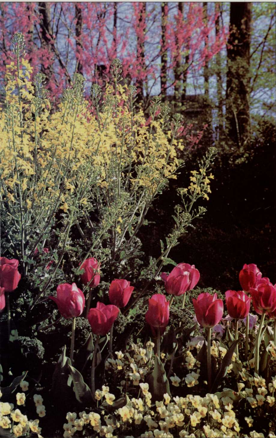
A well-thought-out planting of spring pastels, including Viola Lemon Chiffon, Tulip Attila, and Kale Winterbor.

early spring bloomers. Late-blooming varieties of most, including tulips, are also available in the trade. And pleasing to clients.