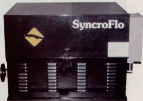
Gator unit is programmable.

The VAF2000 line of automatic water filters in sizes from 10 gpm to unlimited flow with particle removal down to 15 microns. Ideal for landscape irrigation, three types of stainless steel screens are available. Firm also offers a low-cost, highly accurate flowmeter called the Hydro-Flow.