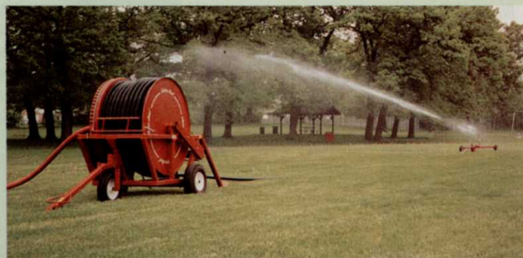
Kifco, Inc.'s B140 can irrigate a football field (about one acre) in a single pass.

K-Rain's new Pro-Plus sprinkler offers adjustable and true-continuous 360° coverage. This new sprinkler can be adjusted from 35° to 360°. Both adjustable and continuous circle heads are in one rotor. The Pro-Plus can be set before installation or while the system is op-