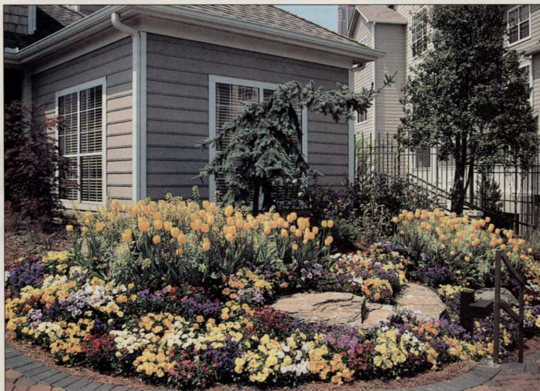
Who wouldn't welcome this colorful spring display featuring a Kale Feather Mix, Tulip Goldader, and Pansy Crystal Bowl Mix?

It's likely that if your company is known for providing color, you're already sold on the benefits of spring bulbs, so let's talk choices. Growing up in Oregon, I always awaited the first blooming snowdrops ( Galanthus nivalis ) in February as a sign that I might once again see some blue in the sky. Snowdrops were quickly followed by crocuses, tulips, daffodils, narcissi, hyacinths and other early bloomers. But, not all of these flowers are