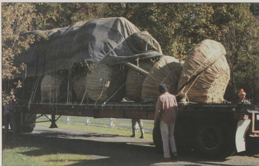
Make sure you have enough labor and the necessary equipment when digging, moving and transplanting large trees.

Numerous studies on transplanting large trees have reported that it takes several years, and many as 10 years, for a