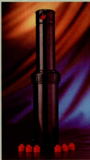
K-Rain's sprinkler is adjustable.

erating. This product also offers a 5" riser that pops up through even the tallest turf. It can be retrofitted to any other sprinkler, says K-Rain. Circle 268