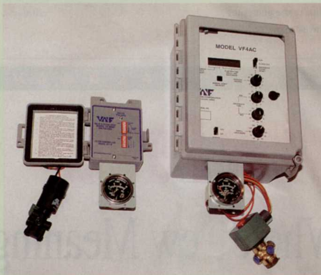
Valve & Filter Co. offers Hydro-Flo flowmeter & automatic filters.

Below are several of the latest and best products available from leading irrigation firms for use in a variety of turfgrass applications.