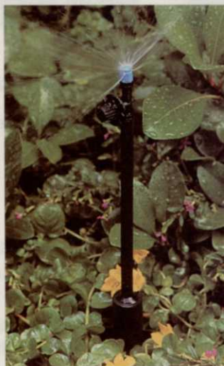
Raindrip Aqua-Pop sprinkler

The Aqua-Pop pop-up irrigation assemblies rise up with only six pounds of water pressure to a height five or nine inches above ground cover. The sprinklers provide even coverage and retract back into the ground when not in use. They come barbed or threaded for connection to quarter- or half-inch PVC. All come with Micro Spray Jets in three different spray patterns: full, half, or quarter circle. Also available are pressure-compensating drippers that maintain rated flow rate for 10-60 psi inlet pressure.