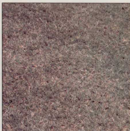
Thin bermudagrass turf on a golf course fairly showing typical above-ground response to root stress caused by nematodes.

—The author is Professor of Nematology, University of Florida, Gainesville, FL.