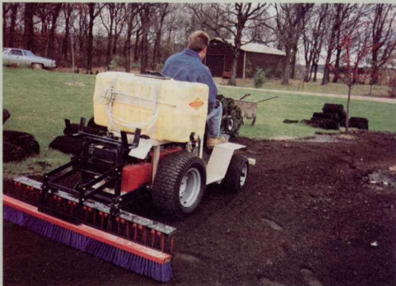
Kromer's Landscape Machine is a one-vehicle tool that can handle lots of landscape and grounds maintenance jobs because of a range of attachments.