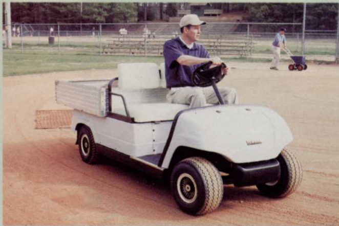
Yamahauler can be converted from a box application to a flatbed.