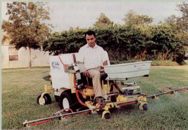
Ground-Tek's GT Pro-Man has adjustable spray gun.