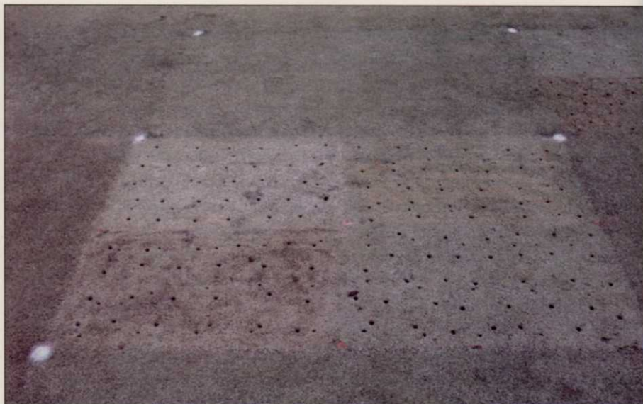
Some of the new 'soft' candidate nematicides must be used at very high rates (approximately 1 ton/acre) giving the appearance of a very heavy topdressing on fine turfgrasses.

The last of this year's "soft" candidates was a product originally developed as a sol-