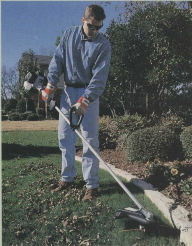
Commercial's SRM-2601 weighs just 11.5 lbs. but offers power.