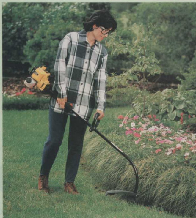
Mitsubishi engines power Deere's commercial string trimmers.