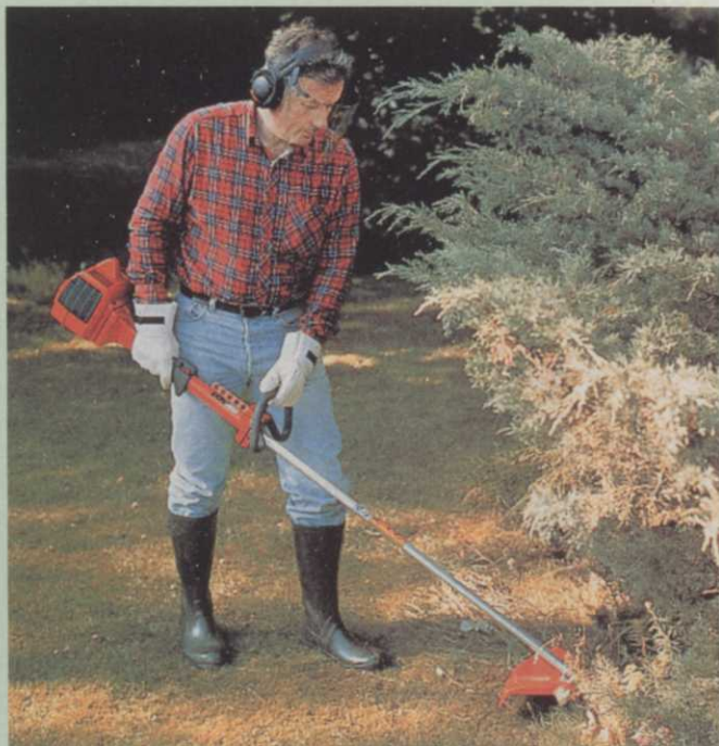
Husqvarna's 225L trimmer is less tiring to work thanks to the LowVib anti-vibration system and strong rubber dampers.