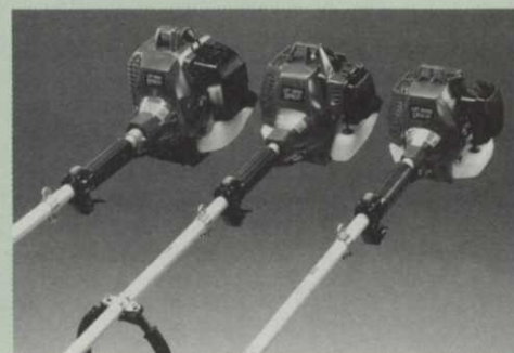
LESCO offers three new string trimmers for professionals. The LST 350 is top-of-the line.

The 225L trimmer from Husqvarna, Charlotte, NC is less tiring to work, thanks to the LowVib anti-vibration system which separates handles and support components from the engine and drive shaft with strong rubber dampers to absorb and minimize vibration. The 11.7-pound unit's Ergo handle is mounted at an angle of 97 degrees to the shaft, placing the cutting