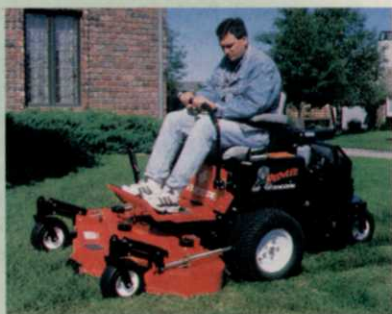
Exmark Lazer Z has an instant height adjust system.

The Suburban Turbine is a 72-inch mowing machine powered by two vertical crankshaft Kohler Command 20 engines. Features an engine oil cooler, hydraulic-drive oil cooler, an Amsoil 1-micron filter, a low-oil warning horn, a Turbinator cyclone pre-cleaner, a Donaldson air filter, stainless steel body panels.