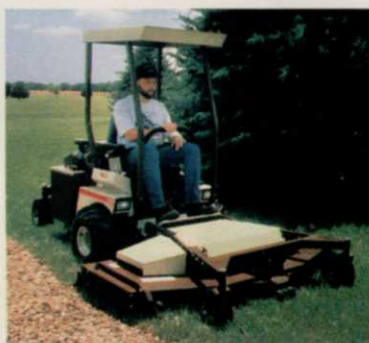
Grasshopper 928D2 works with all company attachments.

With its 28 hp liquid-cooled diesel engine and Gemini2 dual-path hydrostatic direct drive, the zero-radius turn Model 928D2 from Grasshopper, Moundridge, KS provides outstanding maneuverability and productivity for its size. It has