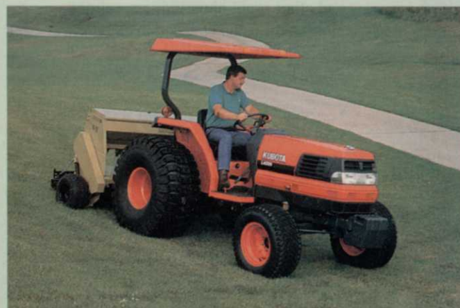
The Grand L Series from Kubota is a full line of low-emission, low vibration mowing machines.