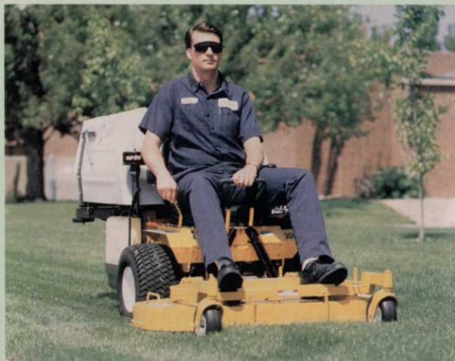
Walker rotary designed to do the work of a walk-behind with the increased productivity of a rider.