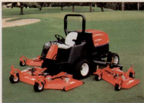
Jacobsen HR 9016 Turbo has a 16-foot cutting width and 8.5 mph speed.

system) diesel engines in 2- and 4-wheel drive, they come in 32.1, 35.2, 38.5 and 45.3 hp models. Glide Shift transmission features clutchless on-the-go operation through all 8 forward and reverse gears.