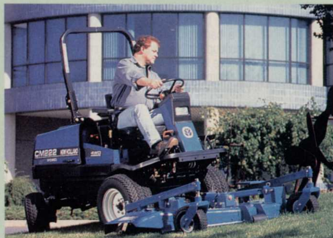
New Holland rider has a cutting width of 60 inches and a height range from 1.5 to 4.5 inches.