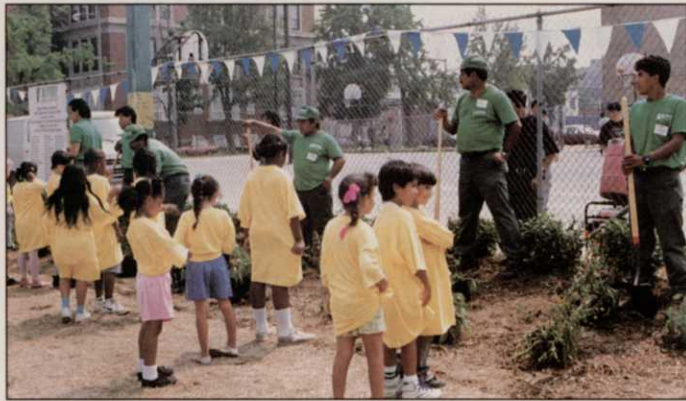
Ruppert Landscape Company at the grand re-opening of 'La Polvosa' (the dust bowl) in D.C. Work is done by the company but the re-opening lets everyone contribute to their community.

Hall, it didn't realize how much excitement the project would generate.