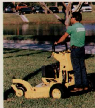
Great Dane's surfer cutting height adjusts from 1.5-5.5"

The zero-radius turn Surfer from Great Dane, Charlotte, NC is just 53 inches long on the 52-inch cut model. Also available are 48 and 61