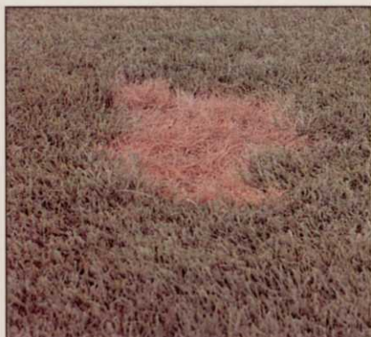
One of the author's key concerns is field errors that can result in misapplication, such as this fertilizer spill.

When using only fast-release nitrogen sources, light applications, \frac{1}{8} to \frac{1}{2} pounds of N/1000 sq. ft., are more desirable, and should be applied more frequently.