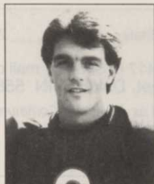
Keynote Speaker March 2nd Doug Flutie Quarterback for the Buffalo Bills

The New England Regional Turfgrass Foundation in cooperation with the University of Rhode Island and the University of Massachusetts