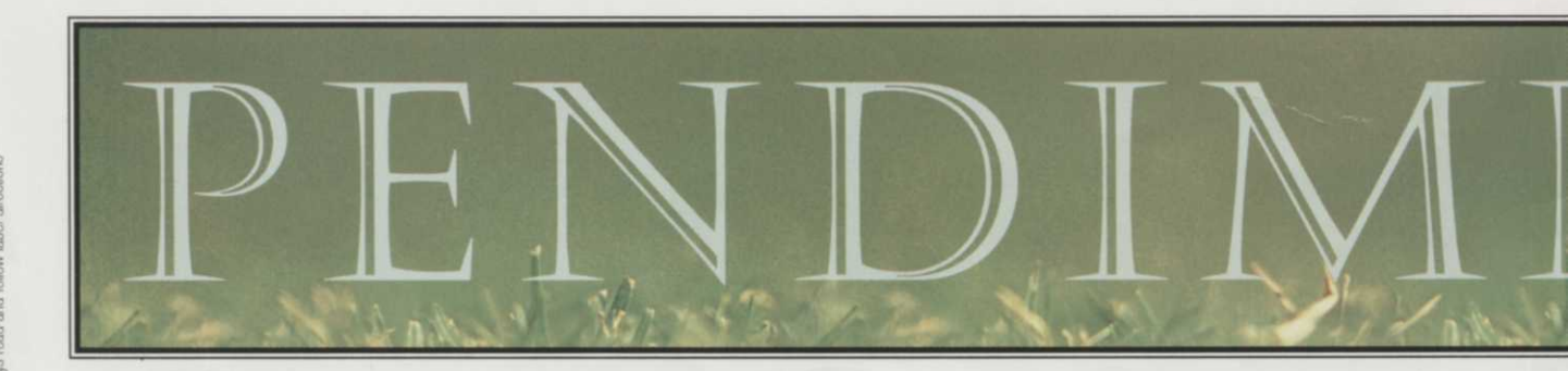
Virgina Polytechnic Institute & State University 1996