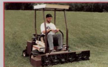
40- or 60-inch AERA-vator™ penetrates hard, dry soil without irrigation. ROPS with overhead canopy is optional.