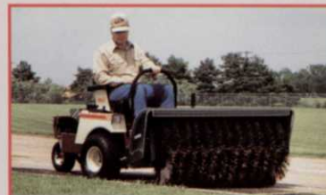
PTO-driven 48- and 60-inch fixed angle rotary brooms handle dirt, debris and clean up to eight inches of snow. 60-inch bidirectional broom available.