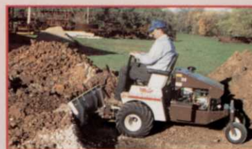
Heavy-duty multipurpose 48- and 60-inch dozer blades move dirt, sand, gravel and snow quickly and easily. The V-snow plow clears sidewalks.