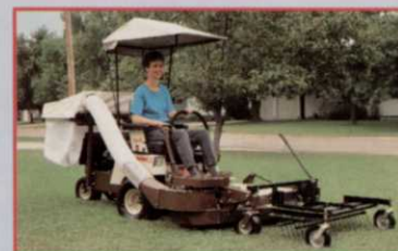
Durable 48- and 60-inch Tine Rake™ dethatchers remove thatch and surface aerate soil. Vinyl sunshade canopy protects operator from sun and heat.