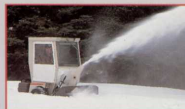
PTO-driven 48- and 60-inch snowthrowers throw snow up to 20 feet away. Winter enclosure for all snow removal attachments provides protection from wind and snow.