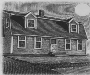
A World Without Trees

Find out how trees can make a world of difference for you, and your neighborhood. For your free brochure write: Trees For America, The National Arbor Day Foundation, Nebraska City, NE 68410.