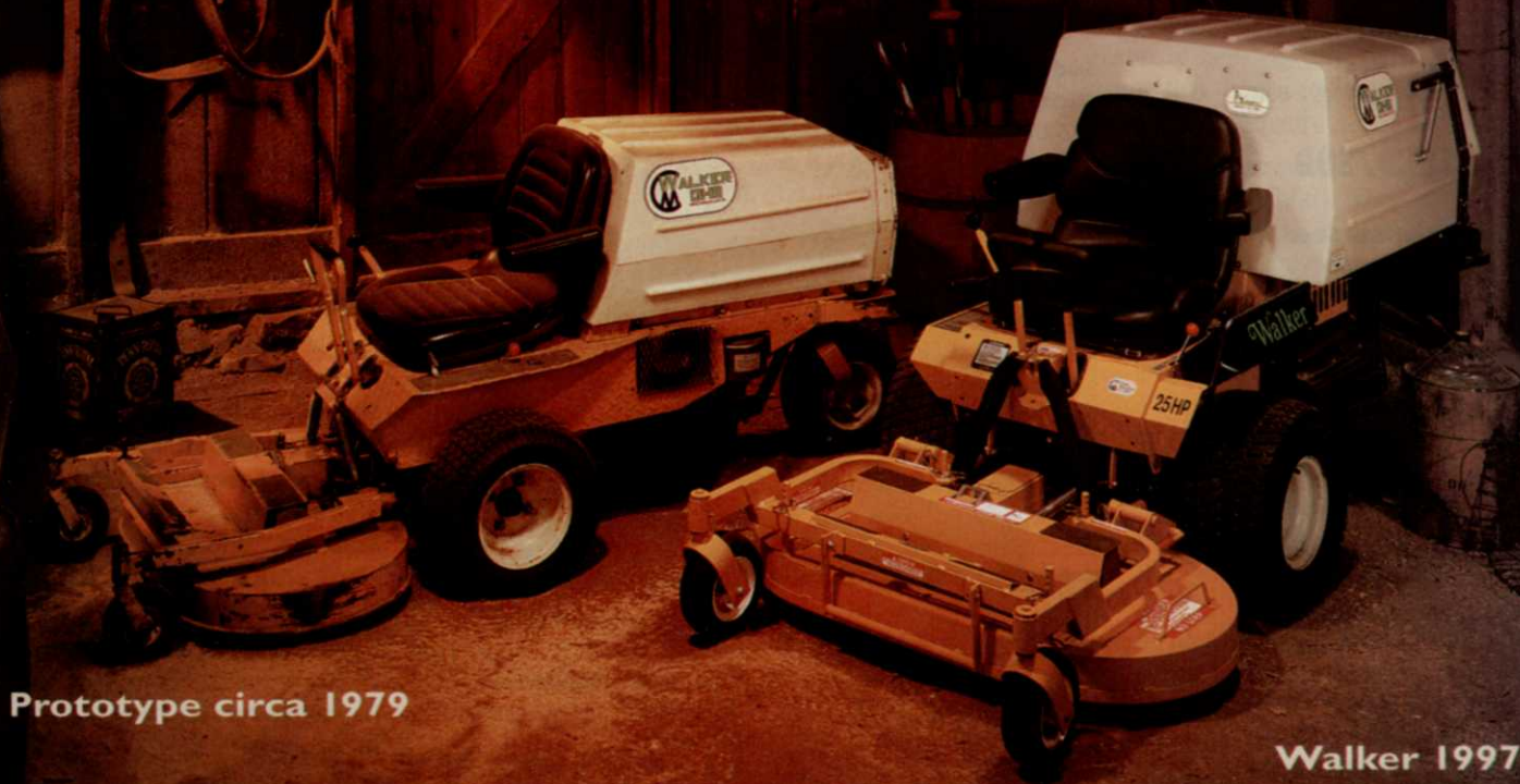
Prototype circa 1979