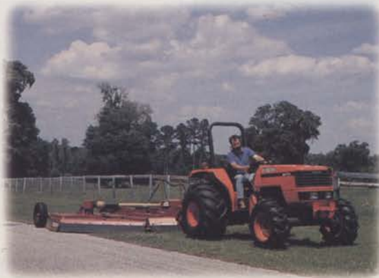
Kubota also offers an M4700 model with 4-wheel drive.

Creep speed transmission has 12 forward speeds (0.17-13.76 mph) with turf tires.