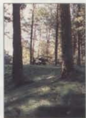
The out-of-play roughs at Minisceongo Golf Club are seeded with Rellani Hard Fescue for low-maintenance, natural beauty.

With so many new bentgrasses on the market competing with the old-time favorites,