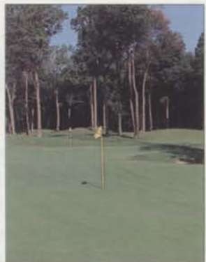
This double green at Minisceongo Golf Club serves the sixth and fifteenth holes. Photos were taken less than one year after seeding.