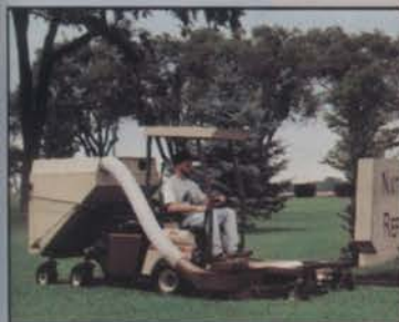
New Model 928D, 28 hp diesel, with Quik-D-Tatch Vac® System and Trail Hopper™ collector.

Grasshopper Selectability will change your mind about what a mower can do.