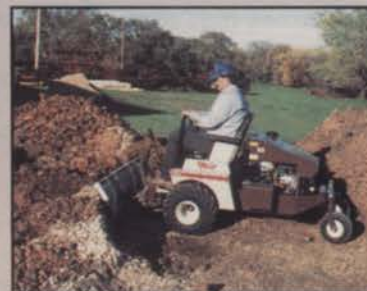
Angle Dozer Blade