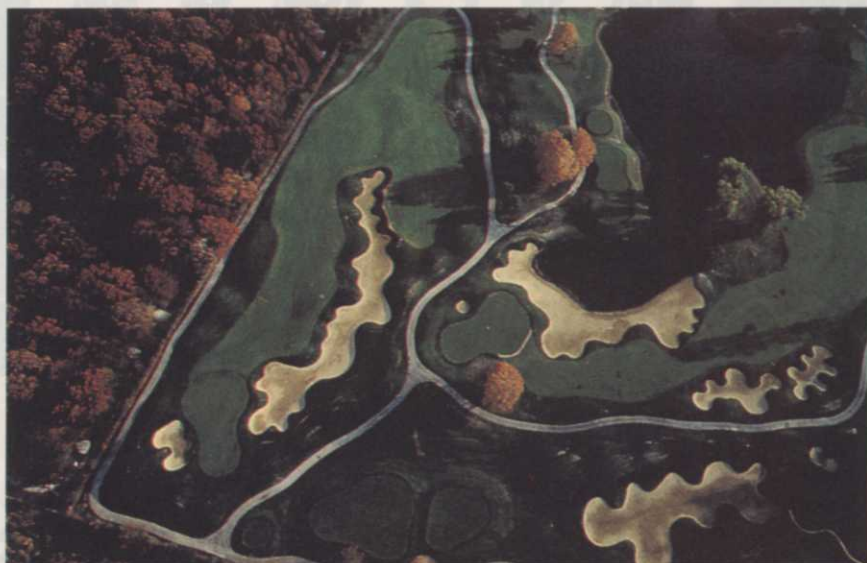
Aerial view shows that holes 2, 3 and 5 are challenging and green at Seven Bridges.