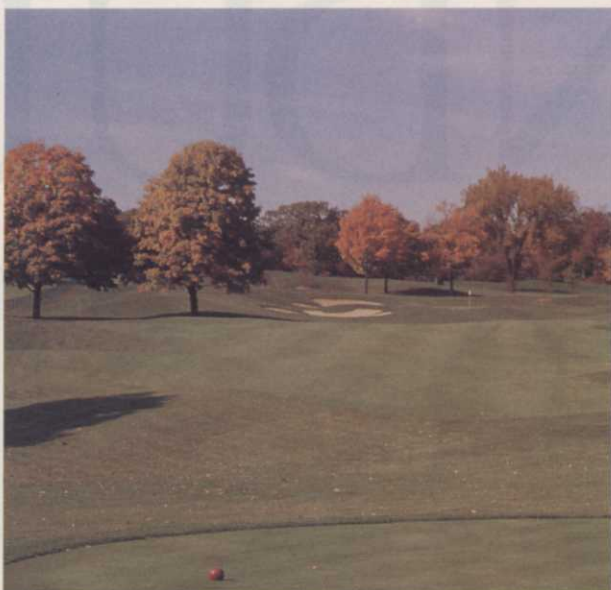
First hole a classic in only Seven Bridges Golf Club's second season.

✓ Consider laying sod "runways" from the cart path the shortest distance to tees