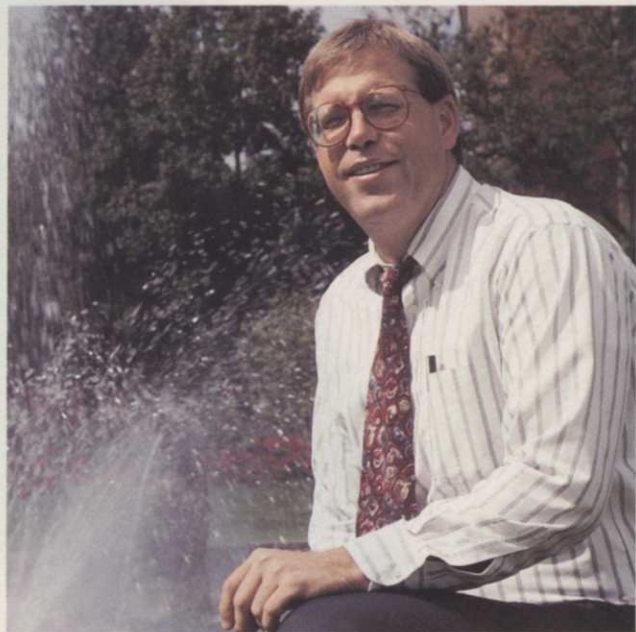
Moffitt: Capital improvements around the St. Louis University campus to include total irrigation system.