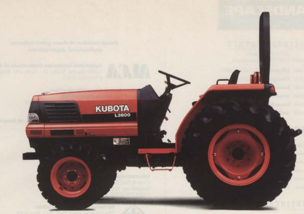
Introducing the new Grand L Series.