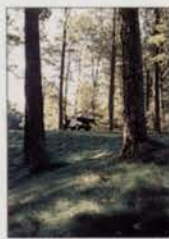
The out-of-play roughs at Minisceongo Golf Club are seeded with Reliant Hard Fescue for low-maintenance, natural beauty.

“I saw the darker color and upright growth of Southshore compared to some of the others. That did it! We placed the order...enough Southshore for every tee, fairway and green.