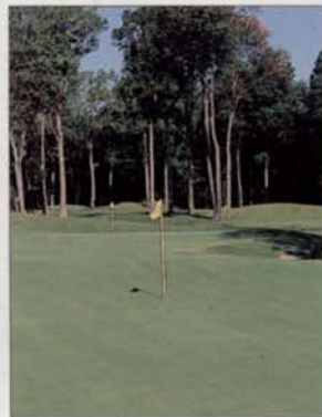
This double green at Minisceongo Golf Club serves the sixth and fifteenth holes. Photos were taken less than one year after seeding.