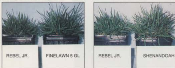
The dense, slower growth of Rebel Jr can be seen one week after mowing.

Rate of Establishment: While Rebel Jr displays moderately slow growth, its rate of establishment is faster than the extreme dwarf varieties such as Bonsai.