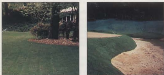
Rebel Jr will give excellent performance in sun or shade. It's ideal for use in hard-to-maintain areas such as golf course green banks, slopes and bunker faces.

Top Performance with Less Maintenance: Rebel Jr from seed or sod is adaptable to full sun or moderate shade. It needs only low to medium maintenance and uses 25% less fertilizer than Kentucky bluegrass.