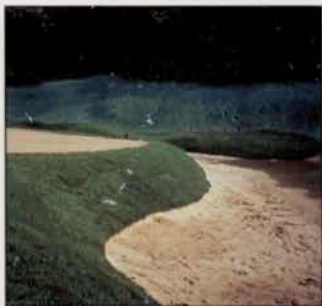
Rebel Jr will give excellent performance in sun or shade. It's ideal for use in hard-to-maintain areas such as golf course green banks, slopes and bunker faces.

Improved Drought Tolerance: A deep, extensive root system allows Rebel Jr to display excellent drought tolerance.