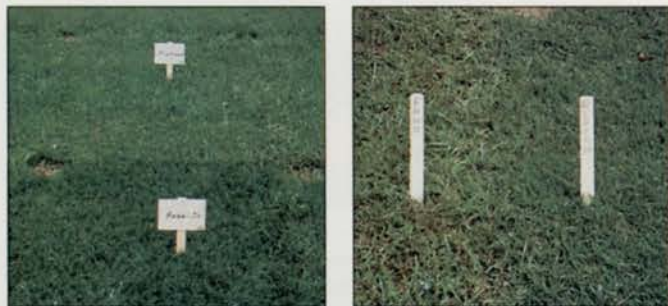
The darker color of Rebel Jr is apparent in these test plots comparing Rebel Jr to other tall fescues.

Excellent Dark Color: When compared to other tall fescues, Rebel Jr provides the deep, dark color preferred by turf professionals.