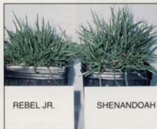
The dense, slower growth of Rebel Jr can be seen one week after mowing.

Top Performance with Less Maintenance: Rebel Jr from seed or sod is adaptable to full sun or moderate shade. It needs only low to medium maintenance and uses 25% less fertilizer than Kentucky bluegrass.