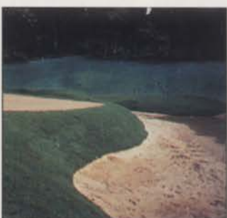
Rebel Jr will give excellent performance in sun or shade. It's ideal for use in hard-to-maintain areas such as golf course green banks, slopes and bunker faces.

Improved Drought Tolerance: A deep, extensive root system allows Rebel Jr to display excellent drought tolerance.