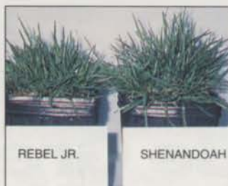
The dense, slower growth of Rebel Jr can be seen one week after mowing.

Top Performance with Less Maintenance: Rebel Jr from seed or sod is adaptable to full sun or moderate shade. It needs only low to medium maintenance and uses 25% less fertilizer than Kentucky bluegrass.