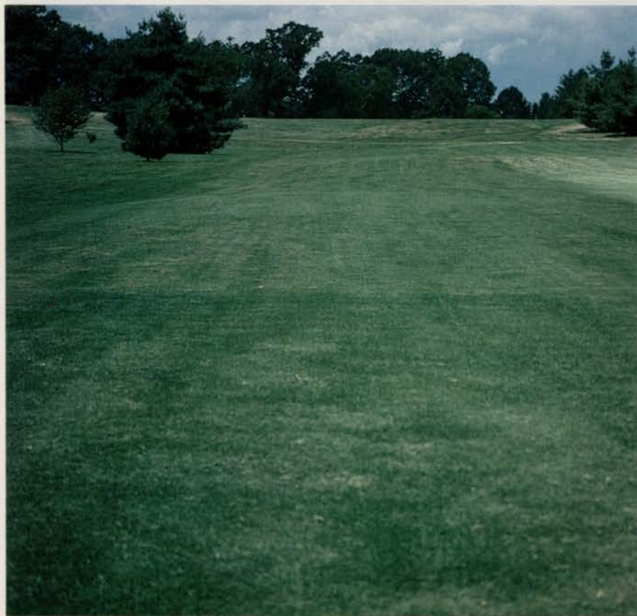
After spring green-up, three sequential applications of trinexapac at four-week intervals resulted in the dark green Kentucky bluegrass fairway. Light green bluegrass was apparent beyond the treated area.