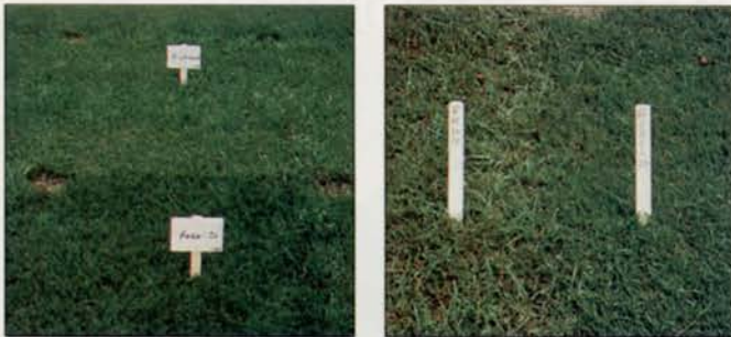
The darker color of Rebel Jr is apparent in these test plots comparing Rebel Jr to other tall fescues.

Excellent Dark Color: When compared to other tall fescues, Rebel Jr provides the deep, dark color preferred by turf professionals.