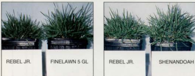
The dense, slower growth of Rebel Jr can be seen one week after mowing.

Rate of Establishment: While Rebel Jr displays moderately slow growth, its rate of establishment is faster than the extreme dwarf varieties such as Bonsai.