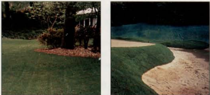
Rebel Jr will give excellent performance in sun or shade. It's ideal for use in hard-to-maintain areas such as golf course green banks, slopes and bunker faces.

Top Performance with Less Maintenance: Rebel Jr from seed or sod is adaptable to full sun or moderate shade. It needs only low to medium maintenance and uses 25% less fertilizer than Kentucky bluegrass.