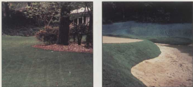
Rebel Jr will give excellent performance in sun or shade. It's ideal for use in hard-to-maintain areas such as golf course green banks, slopes and bunker faces.

Top Performance with Less Maintenance: Rebel Jr from seed or sod is adaptable to full sun or moderate shade. It needs only low to medium maintenance and uses 25% less fertilizer than Kentucky bluegrass.