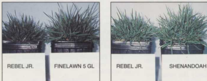
The dense, slower growth of Rebel Jr can be seen one week after mowing.

Rate of Establishment: While Rebel Jr displays moderately slow growth, its rate of establishment is faster than the extreme dwarf varieties such as Bonsai.