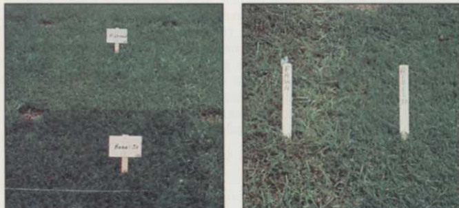
The darker color of Rebel Jr is apparent in these test plots comparing Rebel Jr to other tall fescues.

Excellent Dark Color: When compared to other tall fescues, Rebel Jr provides the deep, dark color preferred by turf professionals.