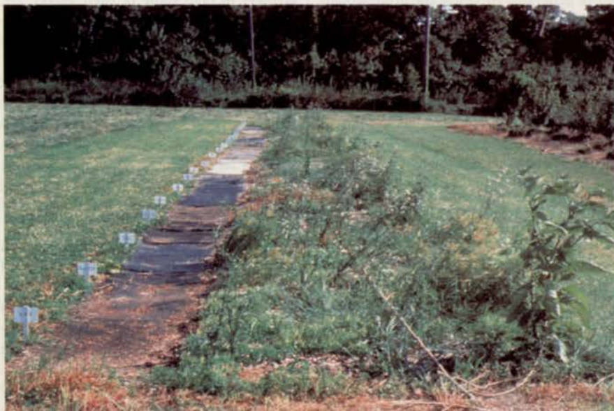
Unmulched fabrics on left have no weeds; weeds evident in mulches atop fabrics on right.