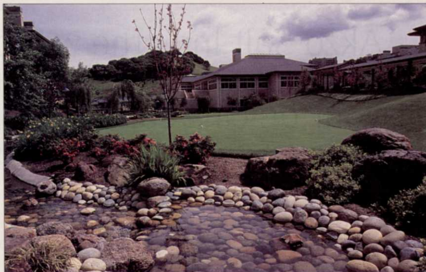
Two putting greens at Smith Ranch—a feature unique to condominiums—pose added challenges. Plant selection must be compatible with soil conditions and water quality.