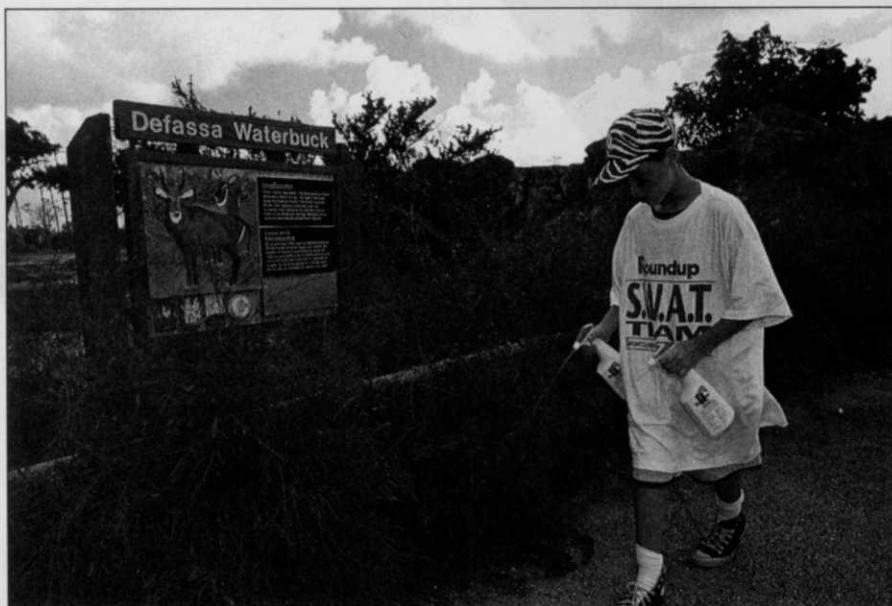
A SWAT volunteer at Miami Metrozoo squirts weed-infested pathways.