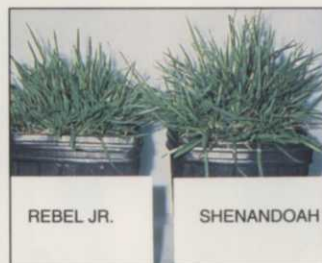
The dense, slower growth of Rebel Jr can be seen one week after mowing.

Top Performance with Less Maintenance: Rebel Jr from seed or sod is adaptable to full sun or moderate shade. It needs only low to medium maintenance and uses 25% less fertilizer than Kentucky bluegrass.