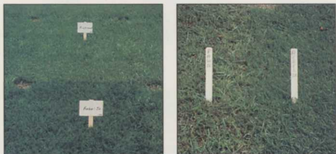
The darker color of Rebel Jr is apparent in these test plots comparing Rebel Jr to other tall fescues.

Excellent Dark Color: When compared to other tall fescues, Rebel Jr provides the deep, dark color preferred by turf professionals.