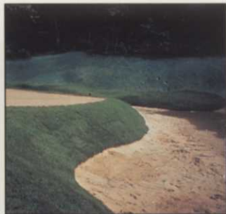
Rebel Jr will give excellent performance in sun or shade. It's ideal for use in hard-to-maintain areas such as golf course green banks, slopes and bunker faces.

Improved Drought Tolerance: A deep, extensive root system allows Rebel Jr to display excellent drought tolerance.