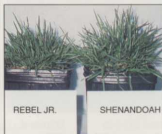
The dense, slower growth of Rebel Jr can be seen one week after mowing.

Top Performance with Less Maintenance: Rebel Jr from seed or sod is adaptable to full sun or moderate shade. It needs only low to medium maintenance and uses 25% less fertilizer than Kentucky bluegrass.