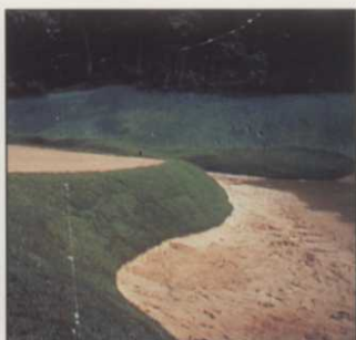
Rebel Jr will give excellent performance in sun or shade. It's ideal for use in hard-to-maintain areas such as golf course green banks, slopes and bunker faces.

Improved Drought Tolerance: A deep, extensive root system allows Rebel Jr to display excellent drought tolerance.