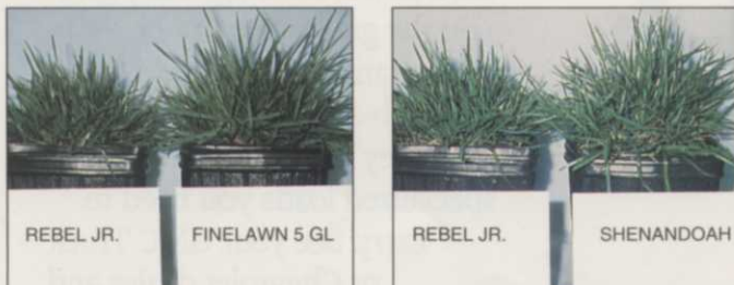
The dense, slower growth of Rebel Jr can be seen one week after mowing.

Rate of Establishment: While Rebel Jr displays moderately slow growth, its rate of establishment is faster than the extreme dwarf varieties such as Bonsai.