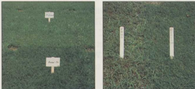
The darker color of Rebel Jr is apparent in these test plots comparing Rebel Jr to other tall fescues.

Excellent Dark Color: When compared to other tall fescues, Rebel Jr provides the deep, dark color preferred by turf professionals.