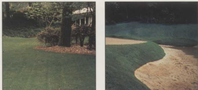
Rebel Jr will give excellent performance in sun or shade. It's ideal for use in hard-to-maintain areas such as golf course green banks, slopes and bunker faces.

Top Performance with Less Maintenance: Rebel Jr from seed or sod is adaptable to full sun or moderate shade. It needs only low to medium maintenance and uses 25% less fertilizer than Kentucky bluegrass.