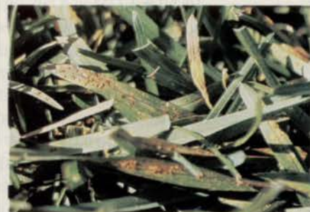
Rust disease as it appears on Kentucky bluegrass.