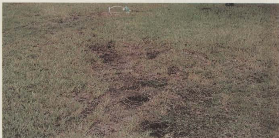
Take-all patch of St. Augustinegrass: yellow, thinning turf in irregular patches.

Exactly which pathogen is causing the continued on page 61