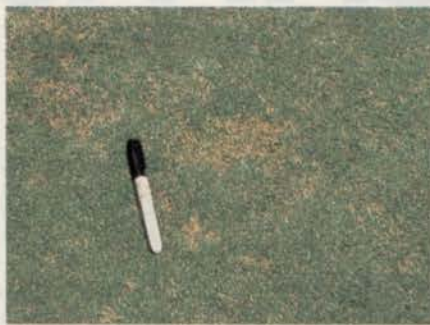
Anthracnose basal stem and crown rot infests a Poa annua putting green.

At present, suppression of the hydrophobic effects of fairy ring is best