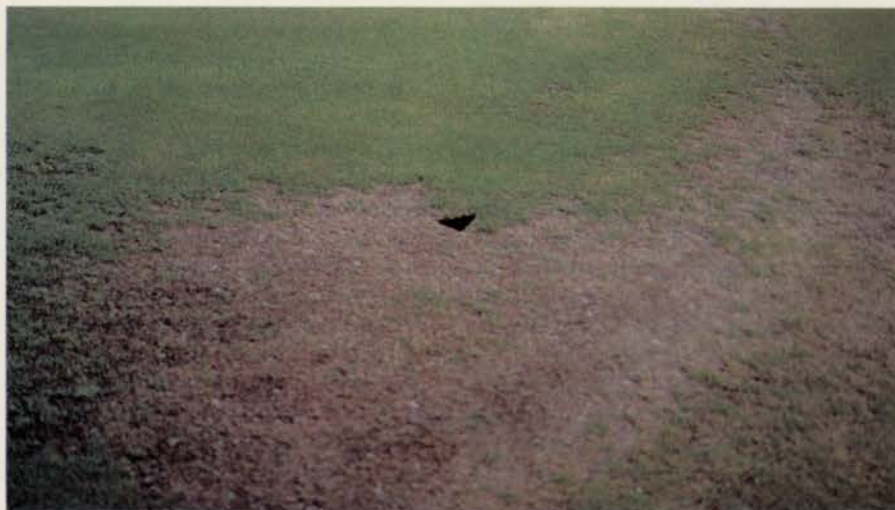
Bermudagrass decline has been observed exclusively on putting greens.

problem seems to depend on the geographic location of the bermudagrass.