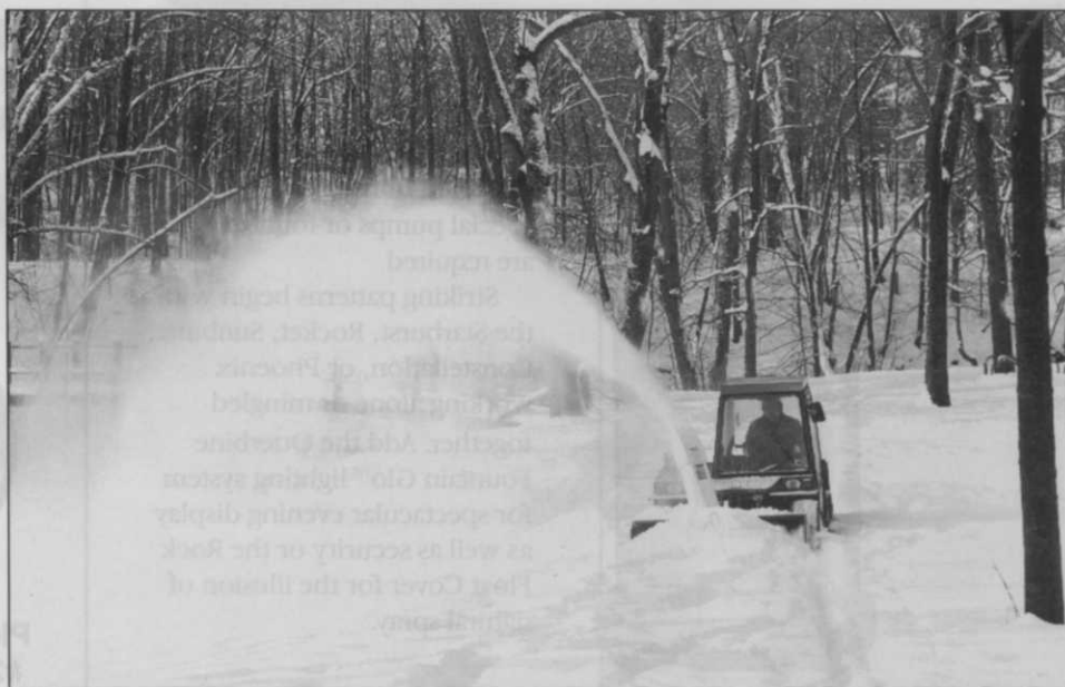
Jacobsen Turfcats attachments cut a 51-inch swath. Rated capacity is 120 tons/hour. Circle No. 191 on Reader Inquiry Card