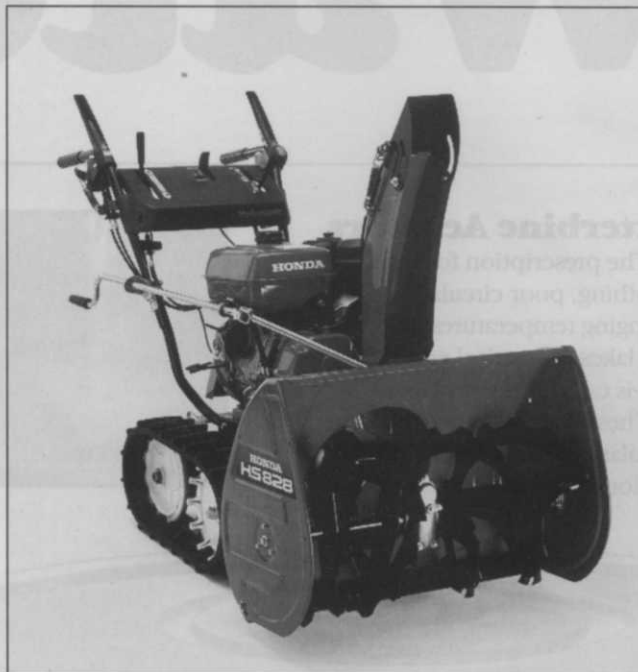
Honda's HS828TAS has a cast iron cylinder sleeve and ball bearing supported crankshaft for durability. Standard equipment includes a 120-volt electric starter and recoil start. Circle No. 190 on Reader Inquiry Card

The auger does not extend beyond the housing.