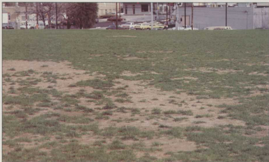
Would minimum standards keep this from happening as often?