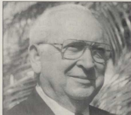
—The author is a former golf course superintendent who is credited with inventing the first turf aerator. He lives in Oakland Park, Fla.