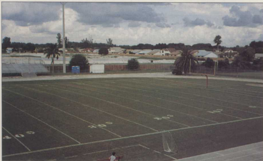
The Cooper City high school field is seeded with Tifton 57 bermudagrass. Benefits include a dense turf with long-lasting color.