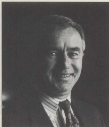
Cosgrove: It's time to 'regroup' and establish minimum standards.

include, but aren't limited to, maintaining the turfgrass playing surfaces.