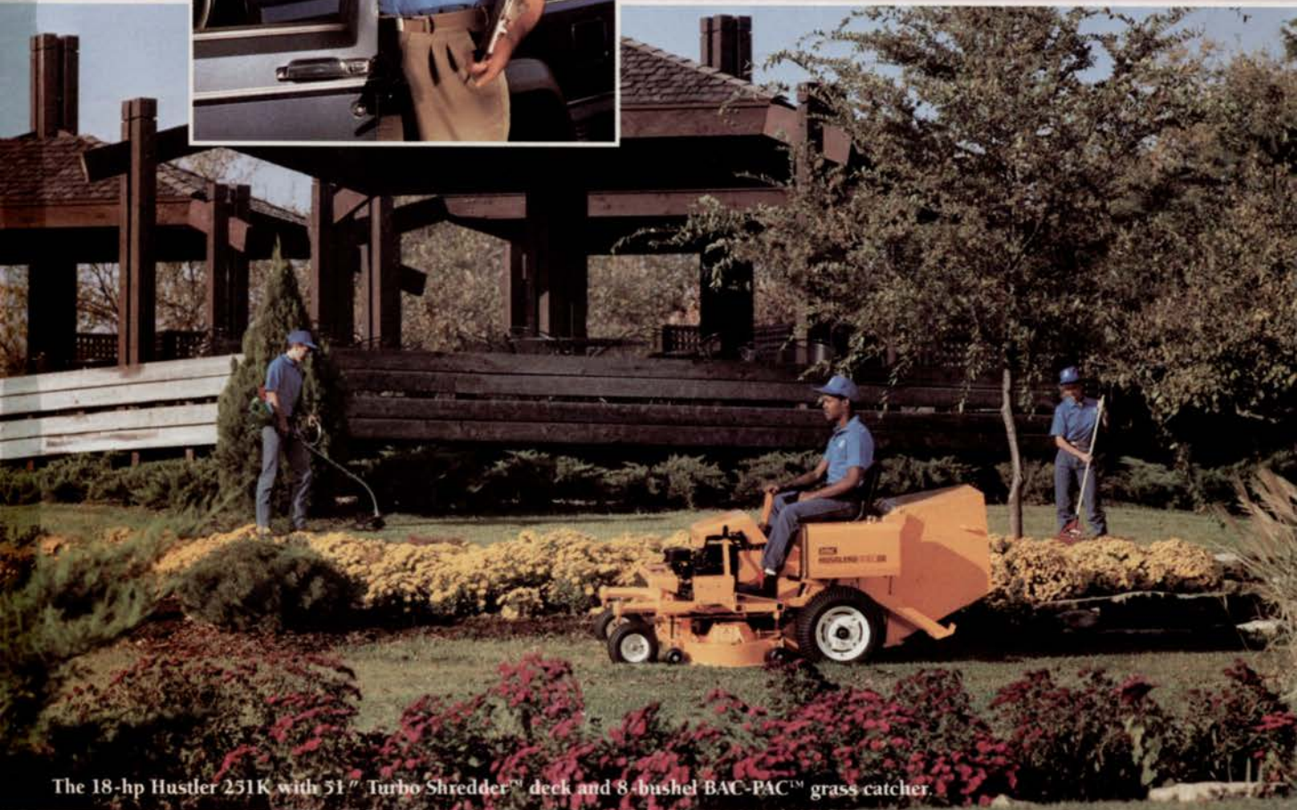
The 18-hp Hustler 231K with 51" Turbo Shredder™ deck and 8-bushel BAC-PAC™ grass catcher.

Buy Hustler for simple operation. For operator comfort, quality cut and unmatched maneuverability, you can't out-mow a Hustler. Call Excel toll free for a FREE Product Guide, or see your local Hustler dealer today.