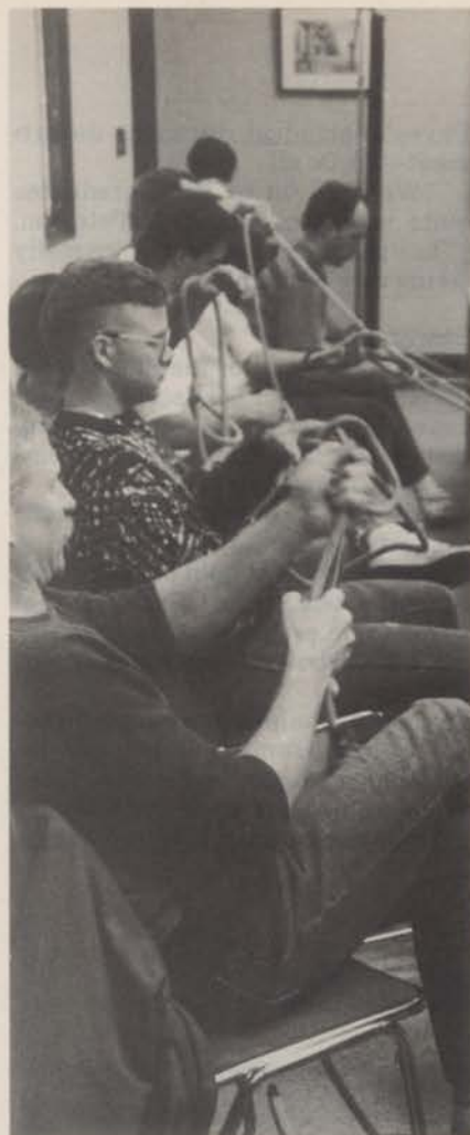
Davey's DITS student/employees receive practical classroom training in rope tying.