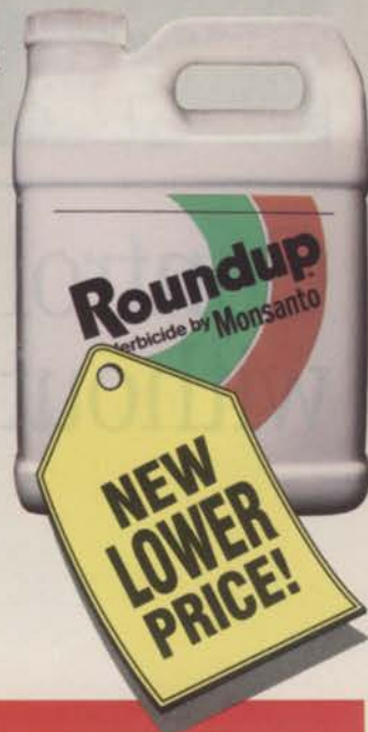
Figure your savings at the new lower price. Then see your dealer or retailer to save on Roundup.

Always read and follow the label for Roundup herbicide. Roundup ® is a registered trademark of Monsanto Company. © Monsanto Company 1991 RGP-1-170BR