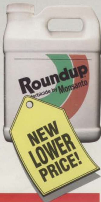
Figure your savings at the new lower price. Then see your dealer or retailer to save on Roundup.

*Suggested retail price. Always read and follow the label for Roundup herbicide. Roundup ® is a registered trademark of Monsanto Company. © Monsanto Company 1991 RGP-1-170B