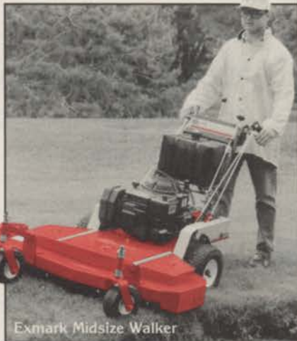
Exmark Midsize Walker

For effortless mowing, even on wet hillsides, you can't beat Exmark's Turf Tracer™ and Midsize Walkers. Our exclusive Posi-Track pulley system sheds water and grass buildup providing unmatched traction. We invite you to ask your dealer for a demonstration and experience the Posi-Track pulley difference. For the dealer nearest you call Exmark: 402/223-4010