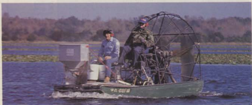
Granular herbicide applied to hydrilla plants.

Known nuisance exotic plants should be managed as soon as they are detected in a water body. However, native species should be managed only when they reach populations which restrict navigation, the intended use of the water, or are a bio-