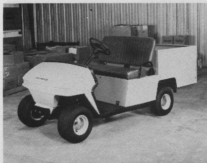
Circle No. 208 on Reader Inquiry Card

The Utilitruck is a rugged, all-purpose vehicle, and may be customized to fit any of your special needs.