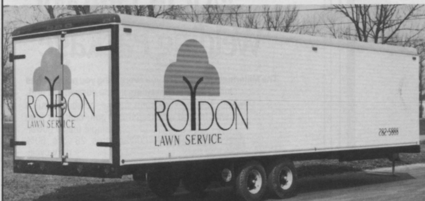
28 FT. WELLS CARGO EXPRESS WAGON

"With a Wells Cargo Behind... You Never Look Back"