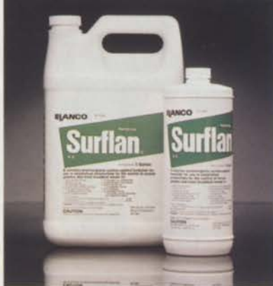
Circle No. 114 on Reader Inquiry Card

Elanco Products Company A Division of Eli Lilly and Company Lilly Corporate Center Dept. EM-455, Indianapolis, IN 46285, U.S.A. Surflan®—(oryzalin, Elanco)