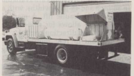
Circle No. 200 on Reader Inquiry Card

Arrowhead says the Dri-box also provides a safe, convenient method of storing empty bags until they can be disposed of properly.