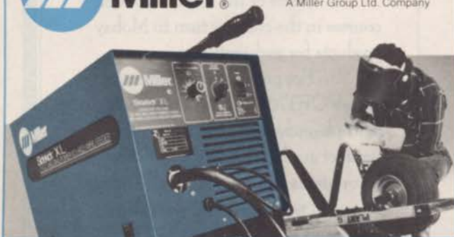
Circle No. 130 on Reader Inquiry Card