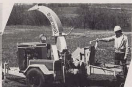
Model 986 — Hydraulic feed disc chipper features: 12" capacity, variable feed rate, gas or diesel, and 15° curbside feed angle for safety.

Write or call your local Olathe/Toro dealer for free demo or call 1-800-255-6438