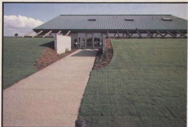
TMI's New Office/Research Facility EST. 1987

That is why TMI is developing Today varieties that will carry us into the 1990's. As varieties like Pennfine , Manhattan II , Barry Perennial Ryegrasses, Rugby and Gnome Kentucky Bluegrass have shown, there is always a home for high quality, top-performing varieties. From international sources and from some of the nation's finest universities, TMI is constantly searching for improvements to our proprietary program with varieties like Aquarius , Wrangler and Bonsai . These new varieties will prove beneficial to all, long into the next century.