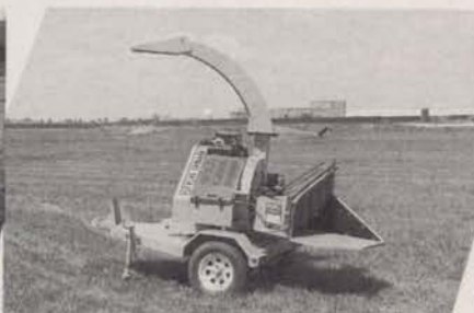
Model 182 — Brush chipper reduces limbs and brush up to 6" in diameter quietly and efficiently.