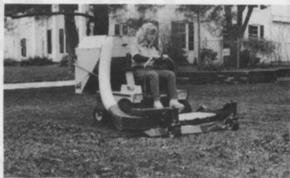
Circle No. 201 on Reader Inquiry Card

available as either a single or twin bag, and one person can easily dump clippings directly into a pickup bed or container.