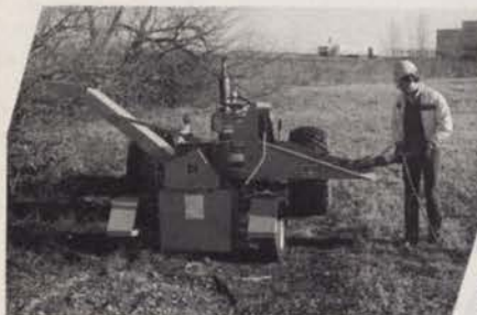
Model 12 — PTO, 3 pt. hitch or tow-type, 7" capacity, 500 lb. drum