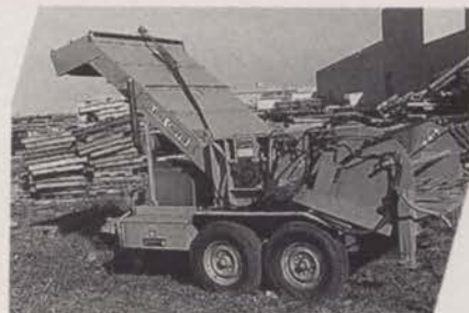
Model 864 — Gets volume reduction of pallets and wood debris for increased disposal capacities

■ Olathe Chippers reduce bulk — cuts down time to landfill sites. Provides mulch for safety and beautification programs. Olathe manufactures five models to handle your chores — from 8 hp 2½" capacity to 175 hp 12" diam. capacity. With units in the field for over 15 years, Olathe keeps proving itself as a leader in the chipper field.