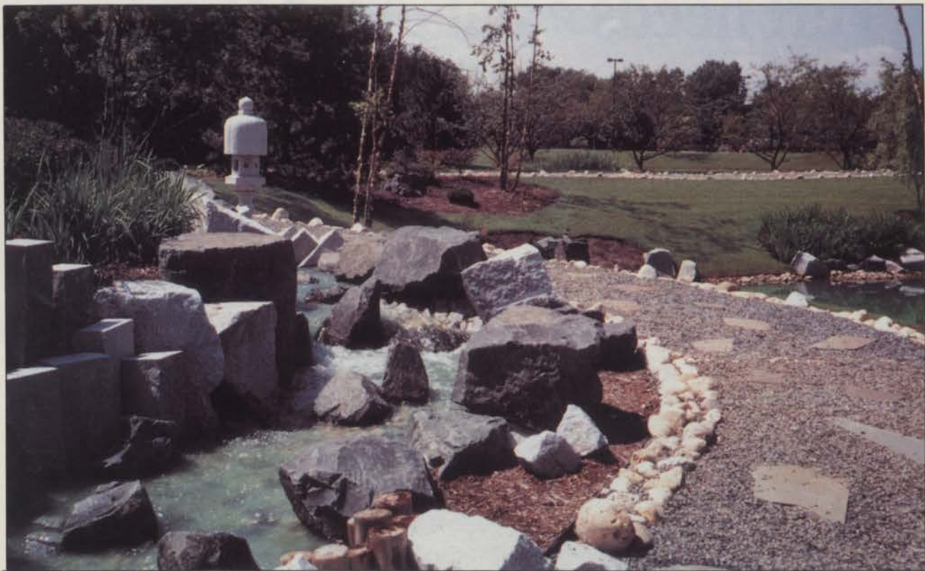
The Shiki-En, or Four Seasons Garden, laces its way through the office buildings of Bannockburn Lake Office Plaza in Lake County, Illinois.