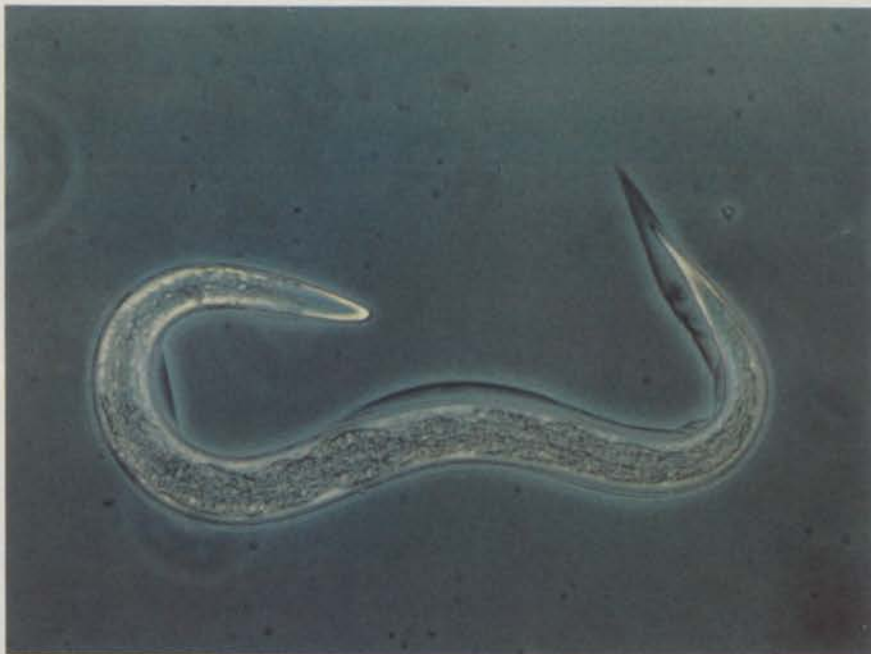
Above: An immature nematode photographed at 300x. Nematodes are an important biological control agent, multiply in the body susceptible insects and carry a bacteria that cause physical damage and rapid death.