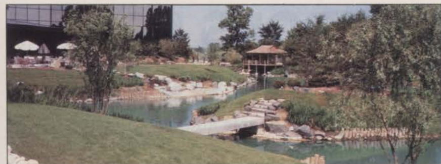
The Japanese garden is based upon an ancient garden design book, Sakuteiki (1040 A.D.), where traditional techniques are expressed in the planting, mounding, stepping-stones and methodical rock arrangements.