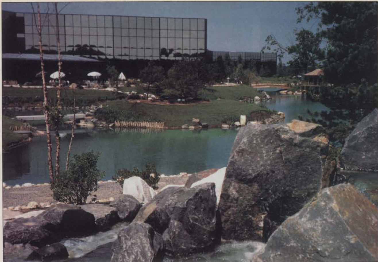
Chicago's regional landscape is captured in the form of waterfall, stream and the overall "lake-scape" effect of the garden.