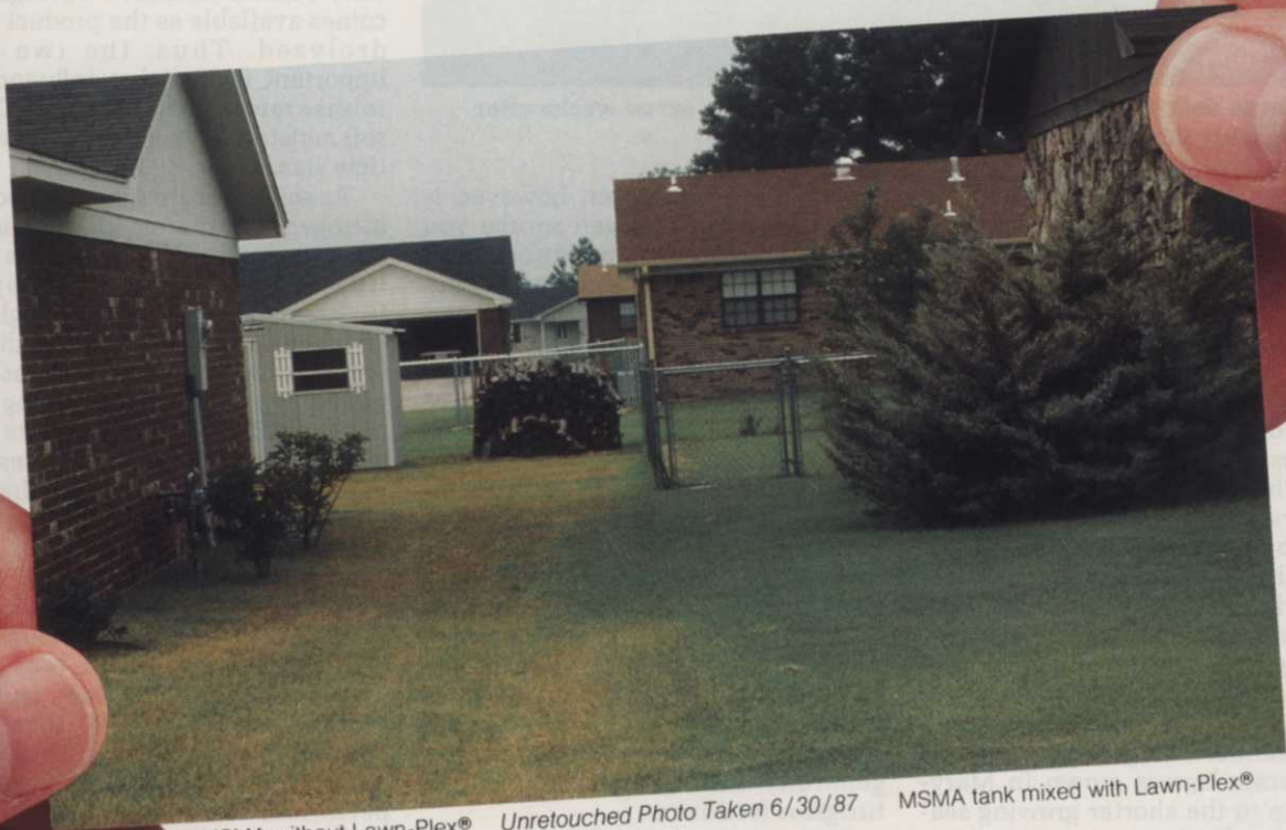
MSMA without Lawn-Plex ® Unretouched Photo Taken 6/30/87 MSMA tank mixed with Lawn-Plex ® On Bermudagrass

"Wow, look at that green! I've heard great things about Lawn-Plex. I'll use it in my next MSMA tank mix. No more brown lawns for me!"