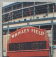
Wrigley Field, Chicago