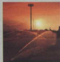
Oviedo High School, Oviedo, Florida

RAIN BIRD PREFERRED BY PROFESSIONALS WORLDWIDE