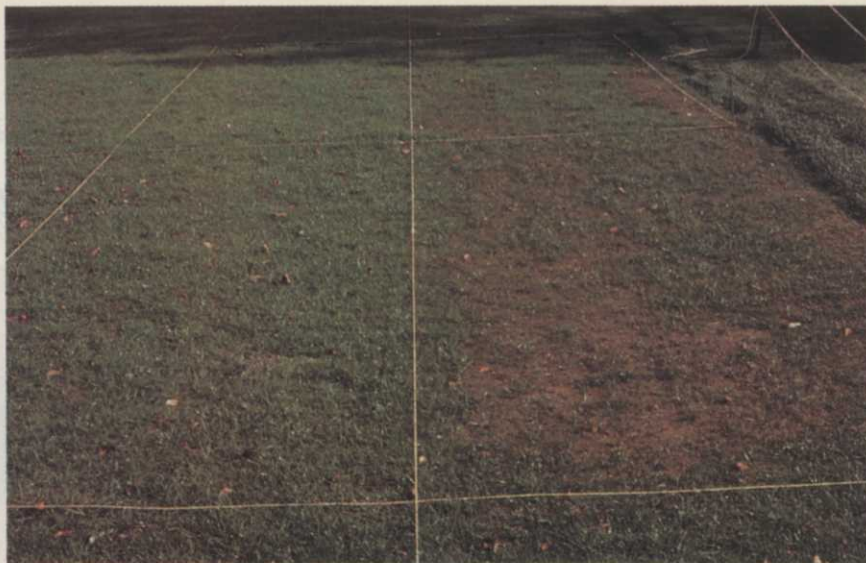
Phosphorus deficiency in seedling Kentucky bluegrass seven weeks after planting. Only the plot on left received phosphorus.

beneficial. Despite the timing of application, higher rates may be very beneficial at certain times of the year and detrimental at others.