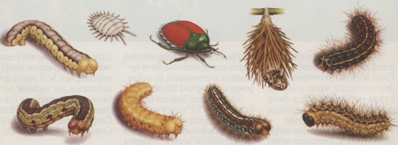
Top row: Leaf-feeding caterpillar, Mealy bug, Japanese beetle, Bagworm, Gypsy moth. Bottom row: Cankerworm, Leaf skeletonizer, Tent caterpillar, Webworm.