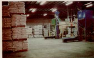
Seed is warehoused, blended and shipped from a 50,000-square-foot LESCO facility in Silverton, Oregon.