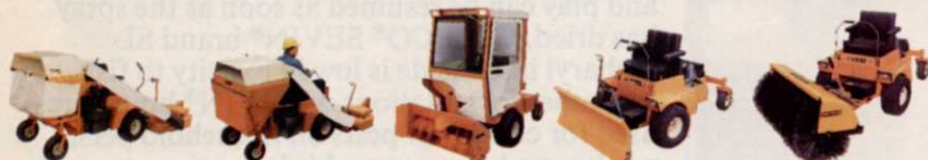
Grass Vac 8 cu. ft. capacity Slide-in Nylon Bag

Adding versatility to the mow'n machine is easy with these easy-on, easy-off attachments: